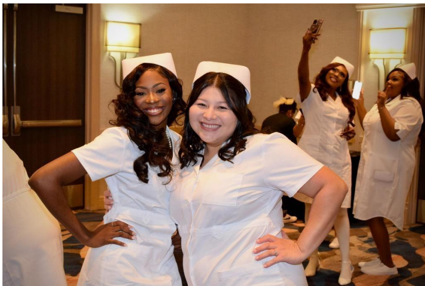
Photo taken at ACI graduation