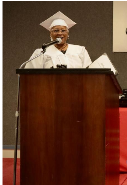
Photo taken at ACI graduation

Arlington Career Institute's Court Reporting Steno Machine Program is approved by the Council on Approved Student Education (CASE) of the National Court Reporters Association (NCRA).