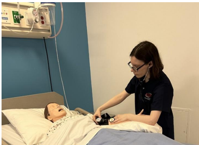
Photo taken at ACI campus