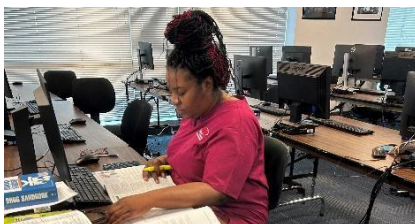
Photo taken at ACI campus

Students should complete the program in approximately nine to ten months.