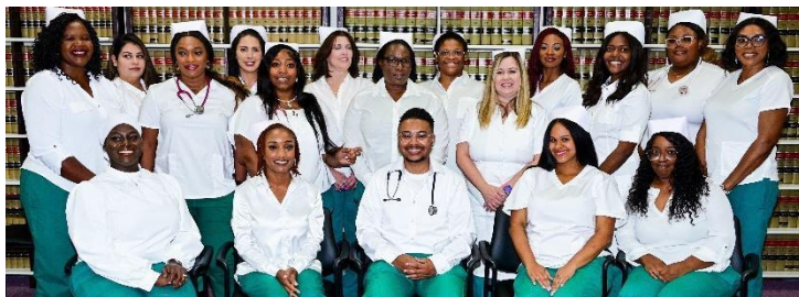
Photo taken at ACI campus