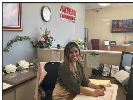
Photo taken at ACI campus