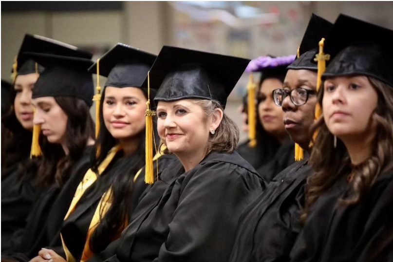
Photo taken at ACI graduation

The instructors and staff of our school are willing to spend extra time and effort working with students who are willing to expend the time and effort necessary to graduate from their chosen program. A student's ultimate success is directly dependent upon his or her own motivation and application to all areas of knowledge and skill development presented in each program.